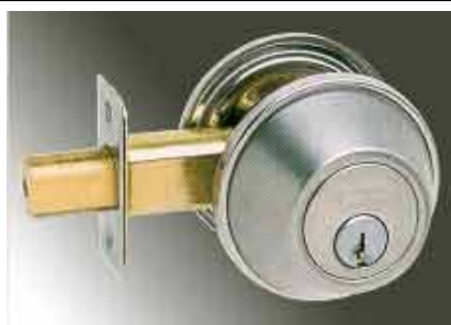
Deadbolt ✘ not-approved

Please be aware that should you install these on emergency egress doors, you shall be contravening the BCA and the Environmental Planning and Assessment Act [NSW] and you will be responsible for consequential penalties.