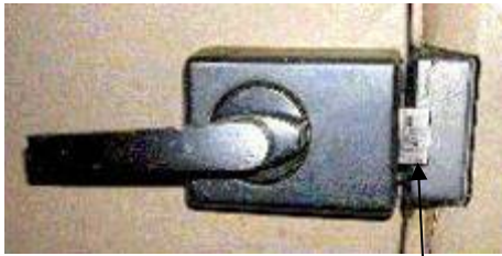
Deadlatch with lever handle approved and preferred

In NSW residential units / blocks of flats (BCA Class 2) are allowed to have a second means of locking (but not more than 2 locksets ) on the main entry door to the common corridor and you may use a deadlatch for this. There is also a prohibition in fitting security doors and grills to unit fire doors, as this adds to the egress problem.