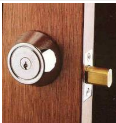
Deadbolt ✘ not-approved